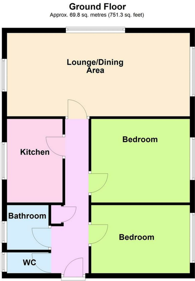
Total area: approx. 69.8 sq. metres (751.3 sq. feet)